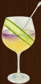
BM19 STAR WARS

Lightly sweetened mocktail blending Lipton black tea boldness, fresh cucumber coolness, apple syrup autumnal sweetness, and pineapple juice tropical tang, lifted by soda water for sparkling finish.