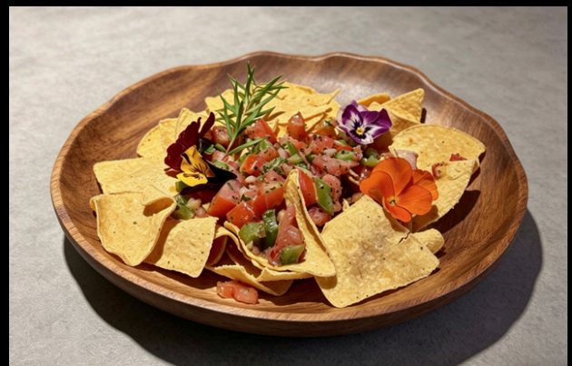
• CHEESY NACHOS RM38