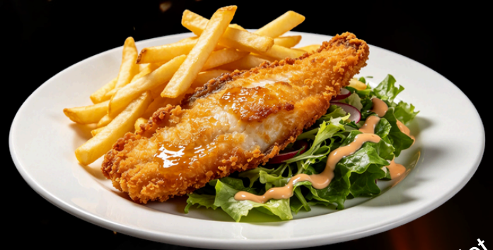
Fried Fish Fillet

Tomato Sauce Spaghetti, Rich & Savory RM28