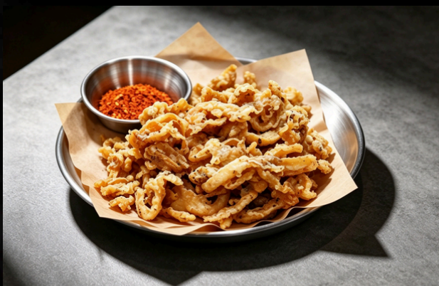
• DEEP FRIED OYSTER MUSHROOM RM22