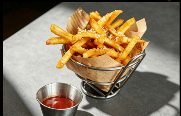
• CRISS CUT FRIES RM18