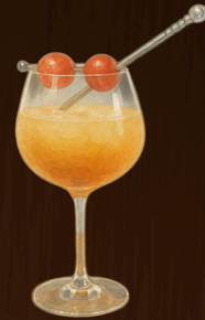
BM17 RED PLUM GINGER TEA

A lively, layered mocktail featuring sweet peach puree, zesty asamboi, red peach and topped up with ginger ale to bring a refreshing fizz