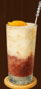
BM18 LAYERED CREAMY VELVET

A Silky, layered mocktail featuring raspberry puree, sweet pineapple juice, and fresh milk this result both rich and creamy, like a cross between smoothie and milky mango yogurt