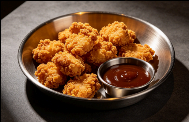
• CHICKEN POPCORN RM22

"Crispy, savory bites to pair perfectly with your drinks"