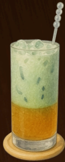
BM16 PEACH OR CHA

A harmonious blend of sweet peach puree, zesty orange juice and earthy sweet matcha tea. This drink is lightly effervescent, with a subtle herbal complexity from the matcha and a bright, fruity finish.