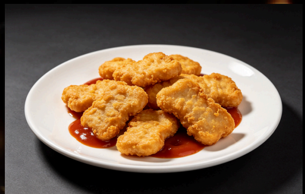
• CHICKEN NUGGETS RM18 Crispy fried chicken bites, juicy and tender 6 pcs