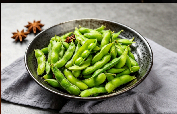
• EDAMAME RM15