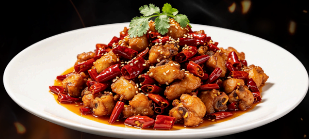
Lak Zi Gai

Fried Fish Fillet with Salad and Fries RM35